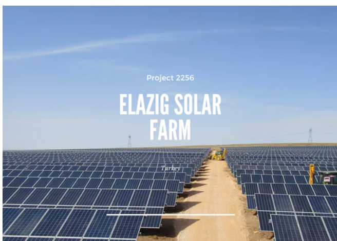
Project 2256: Elazig Solar Farm in Turkey