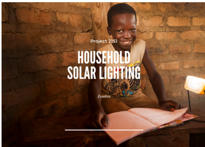
Project 2151: Household Solar Lighting in Zambia

An example of projects supported include: