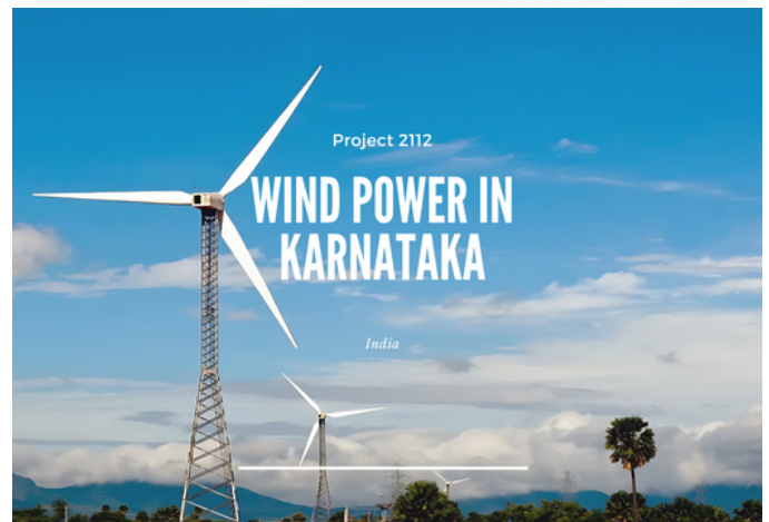
Project 2112: Wind Power in Karnataka