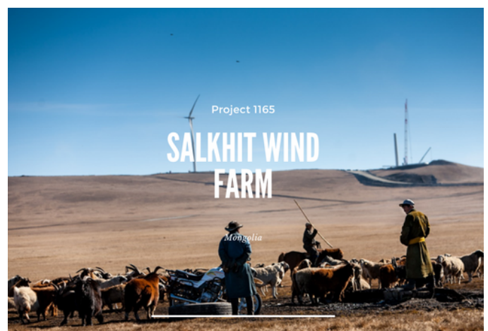
Project 1165: Salkhit Wind Farm in Mongolia